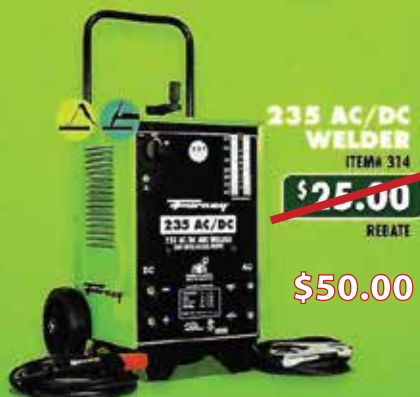
235 AC/DC WELDER ITEM# 314