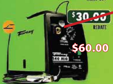
140 MIG WELDER ITEM# 309