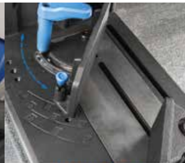
DURABLE 0° - 45° VISE WITH MITER DETENTS & LOCKING PIN