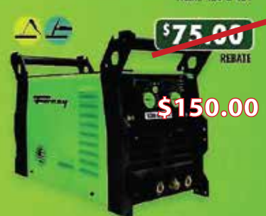
220 AC/DC TIG & AC/DC TIG AMP TROL WELDER ITEM# 420 & 421