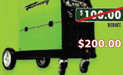
242 DUAL MIG WELDER ALUMINUM PACKAGE ITEM# 11334