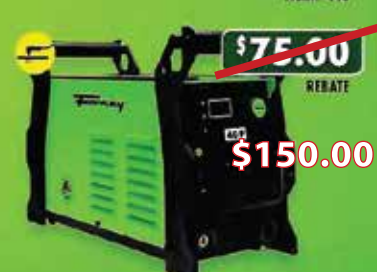
40 P PLASMA CUTTER ITEM# 440