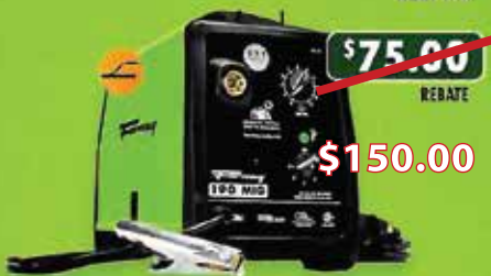
190 MIG WELDER ITEM# 318