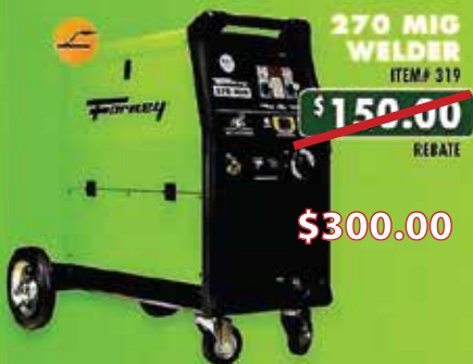
270 MIG WELDER ITEM# 319