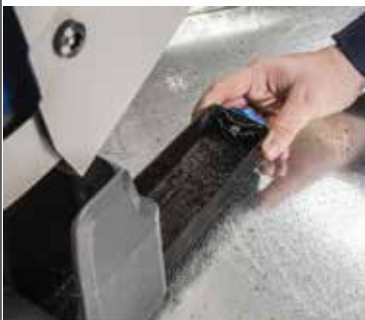
CHIP COLLECTION TRAY FOR A CLEANER WORKING ENVIRONMENT