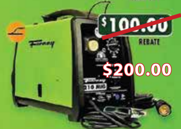
210 MIG WELDER ITEM# 311