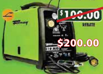
210 MIG WELDER ALUMINUM PACKAGE ITEM# 11342