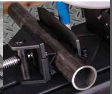
ATTACHABLE 'V' SHAPE BLOCK INCLUDED FOR SECURE CLAMPING OF ROUND & SQUARE TUBE