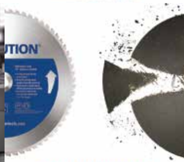
SAFER & MORE ECONOMICAL THAN ABRASIVE CUTTING