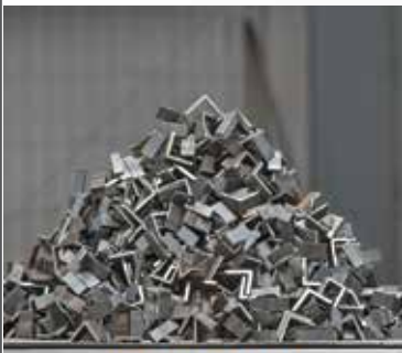
LONG-LIFE TCT BLADE LOWEST COST-PER-CUT, COMPARED TO ABRASIVE CUTTING