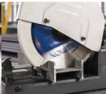
POWERFUL 15 AMP HI-TORQUE, OPTIMIZED GEARBOX & BLADE SYSTEM