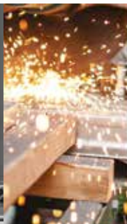
INSTANT WORKABLE FINISH NO HEAT, NO BURRS & VIRTUALLY NO SPARKS WHEN CUTTING STEEL