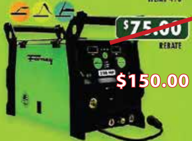
220 MULTI-PROCESS WELDER ITEM# 410