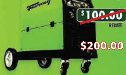
242 DUAL MIG WELDER ITEM# 327