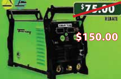
220 ST PRO WELDER ITEM# 430